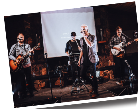
Christian band The Color performing in Windsor, ON at UCB Canada's "Inspiration Celebration."