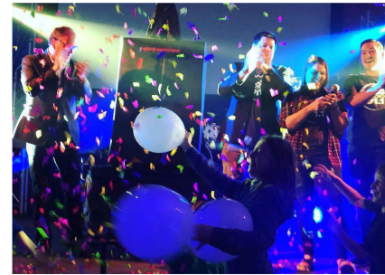
A festive time was had by all at UCB Radio 91.1's launch event in Fort McMurray!

The National Media Centre renovations are about 80% of the way done. The current area is very limited, so we're excited to utilize the upper space to be able to have a greater impact in Canada.